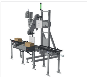
Compatible with ferag.easychain